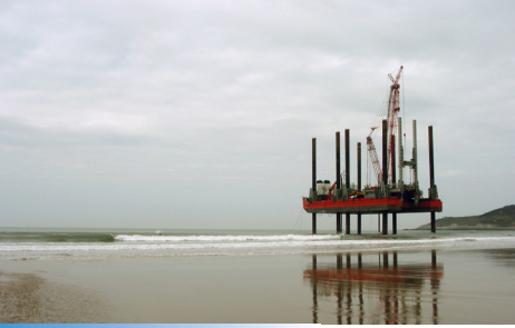
Oil & Mining Industries - Government Agencies

Professional Imaging Solutions HD Series