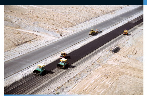
Architects - Engineers - Contractors