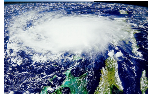
Geographic Information Systems