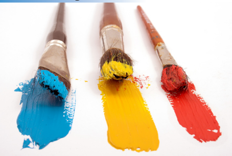
Copyshops - Reprographics