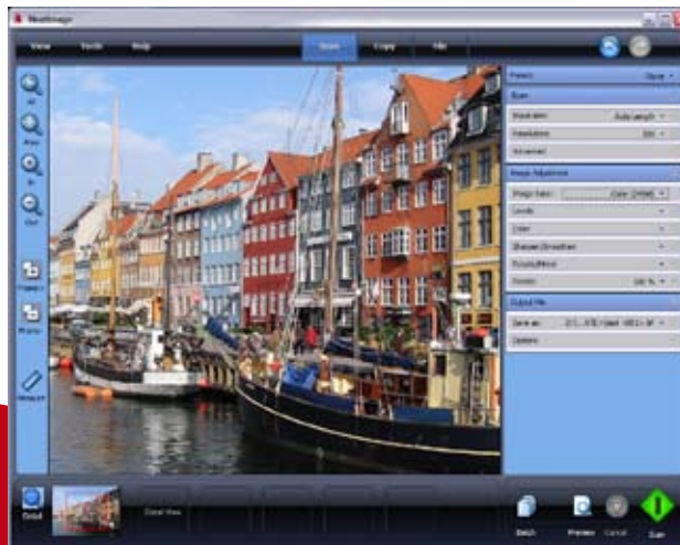
“The easy-to-navigate Nextimage interface”