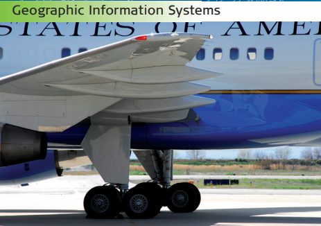
Government - Municipalities